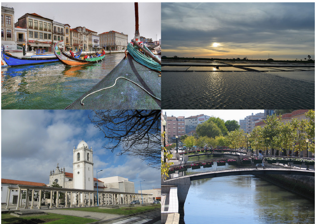
Top left: moliceiros. Top right: salt beds. Bottom left: Aveiro Cathedral. Bottom right: the central canal.