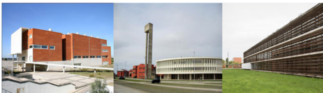
Left: the library. Centre: “caloiródromo” and the water tank. Right: the geosciences department.