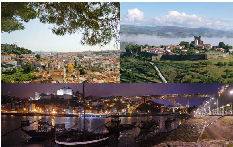
Top left: Lisbon. Top right: Bragança. Bottom: Porto.

Portugal is a nation in south-western Europe, in the west of the Iberian Peninsula. To the north and east it is bordered by Spain and to the south and west by the Atlantic Ocean. The Azores (Açores) and the Madeira islands, both located in this ocean, are the autonomous regions of Portugal. The Portuguese population is around 10.5 million people and the capital of Portugal is Lisbon. Its other important cities are Porto, Coimbra, Braga, Aveiro, Faro, Funchal, and Ponta Delgada.